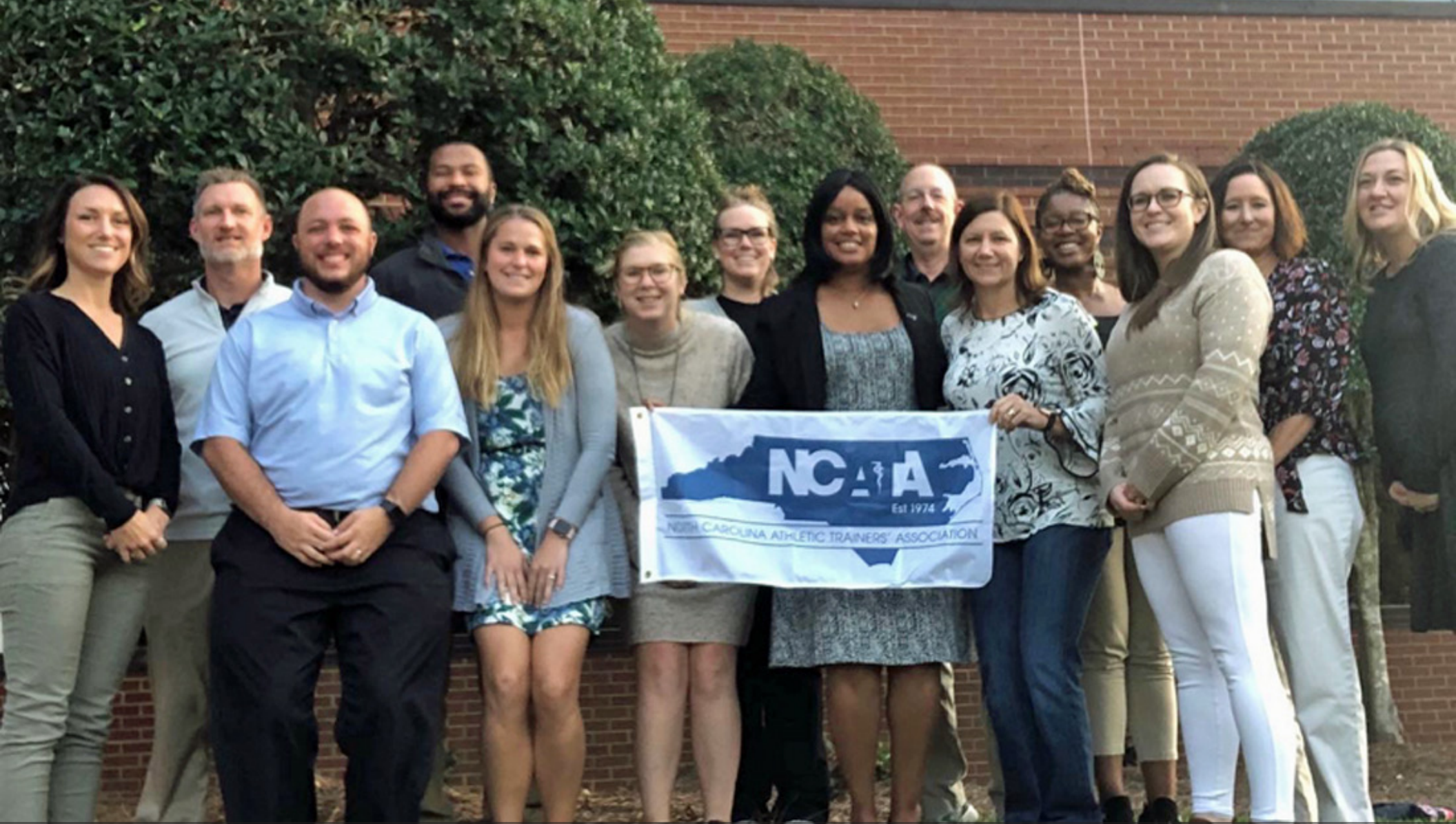
The NCATA Committee Chairs and Board Members.